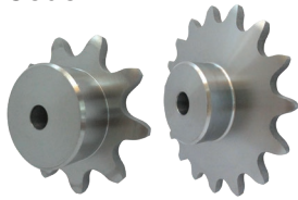
Ground Specification Welded Specification